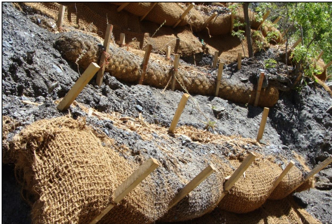
Coir block and coir roll installations on extremely steep slope prior to seedling planting, 2011