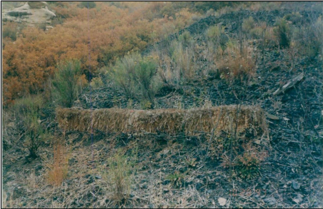
Trial installation on Gob Site A2N of straw bales with live cuttings at the base of the bales a few months after installation, 1997