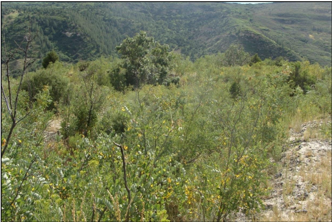
Yellowing of leaves and dieback of New Mexico locust, July 2012