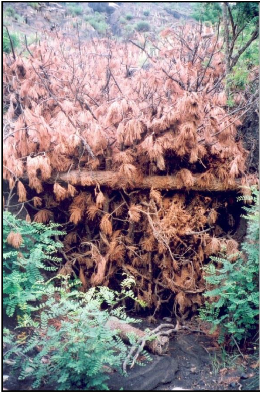
Branch packing in large gully, looking upstream, 1999