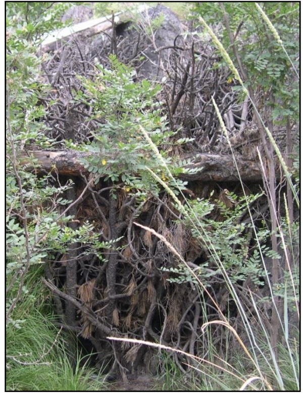
Branch packing at same location, 2010