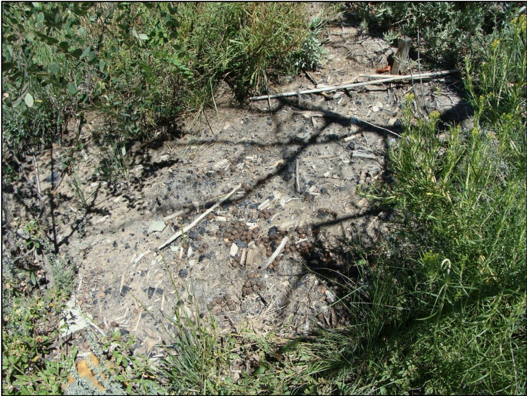
Animal impact on mineral cycle, Gob A2N, 2010