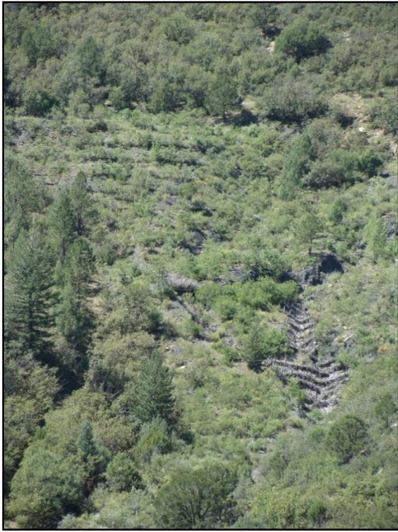
Close-up of Gob Site A1, 2010