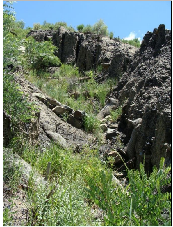
Gully with sediment logs, 2010