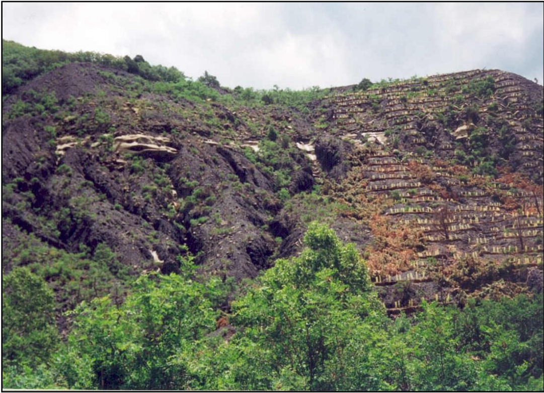
West-facing Gob Site A2N during pilot project, 1999