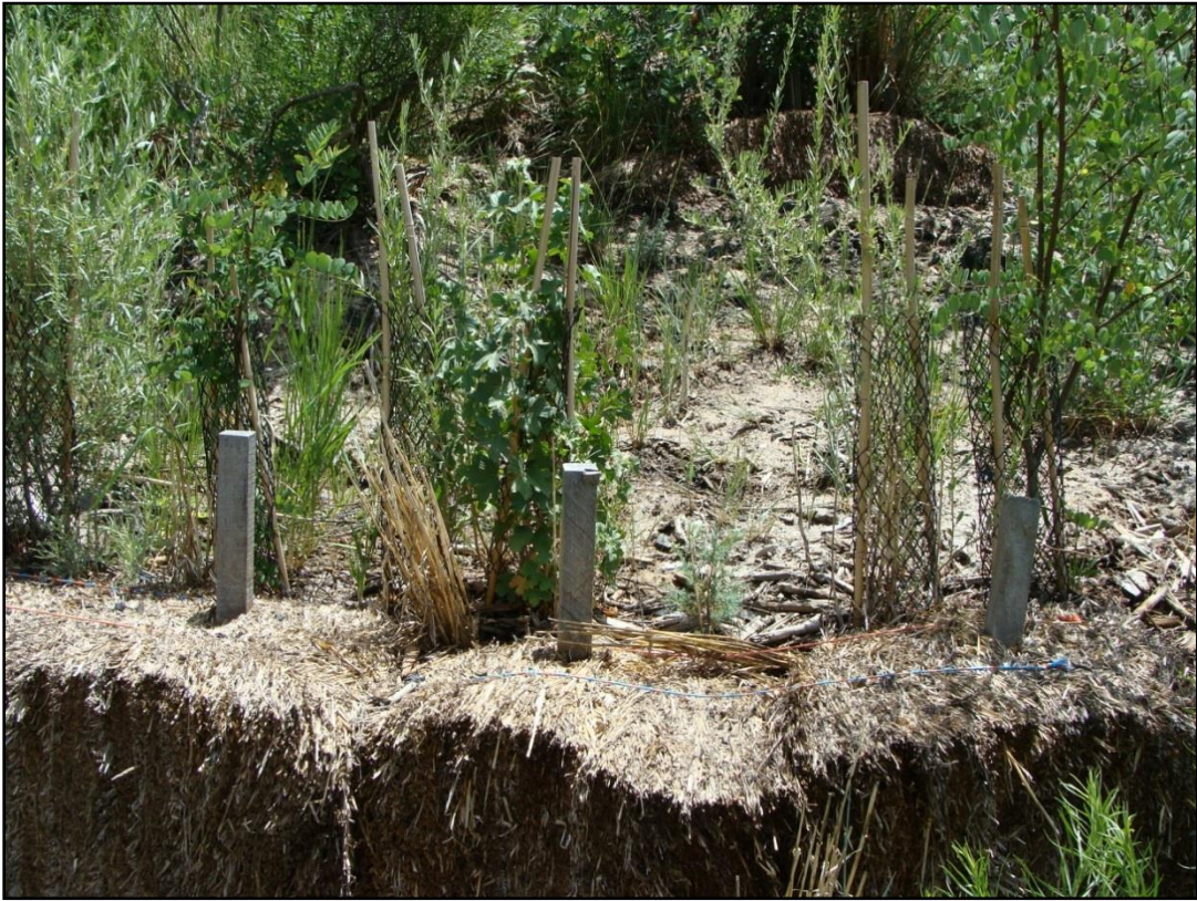
Closely spaced seedling plantings along straw bale terrace, 2010