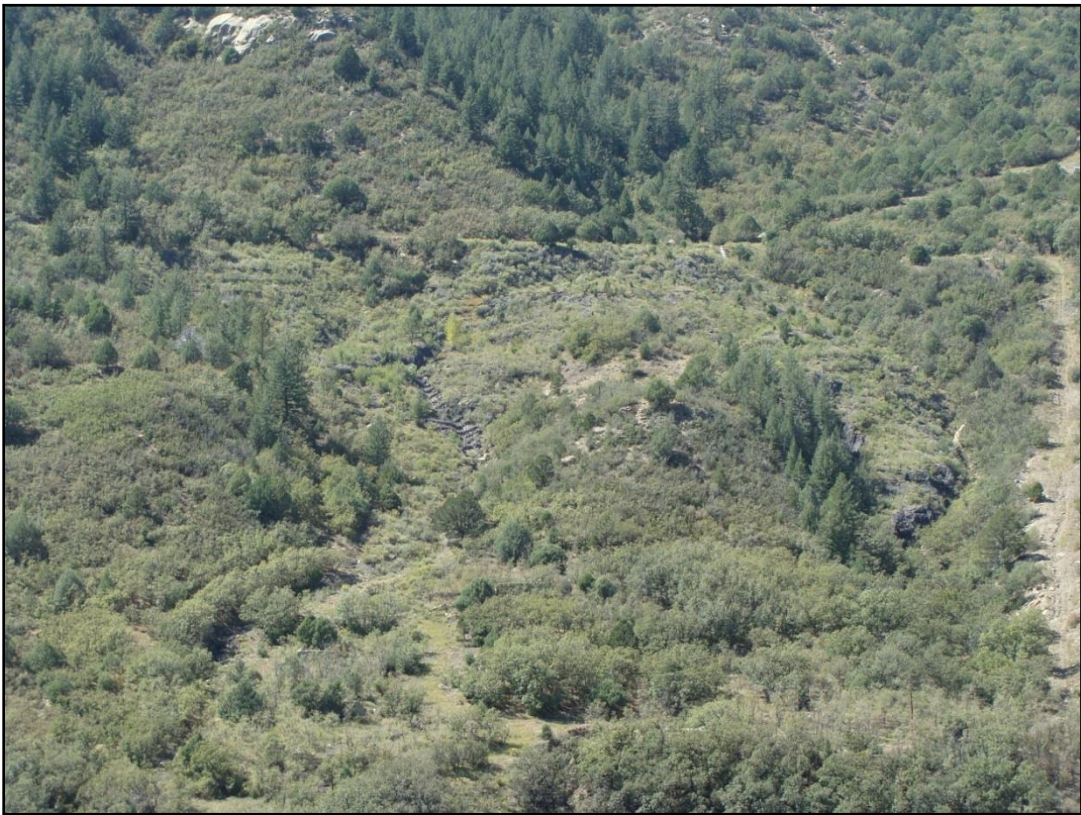
Gob Site A1, September 2010