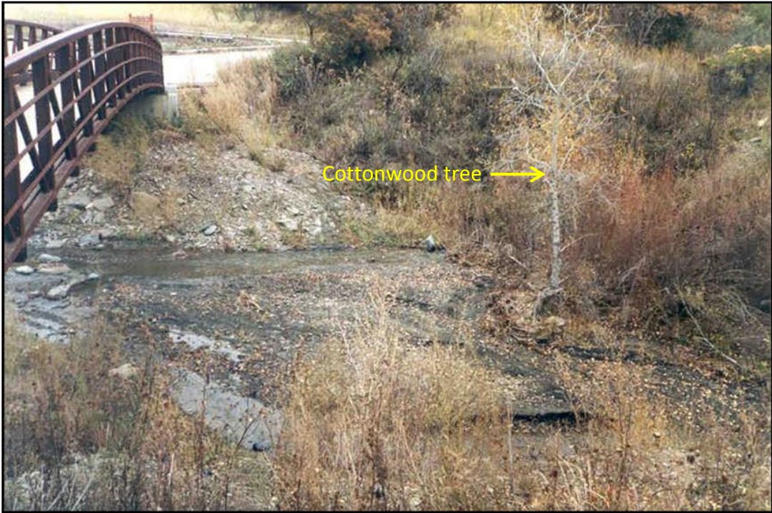
Coal gob in Chicorica Creek, 1997