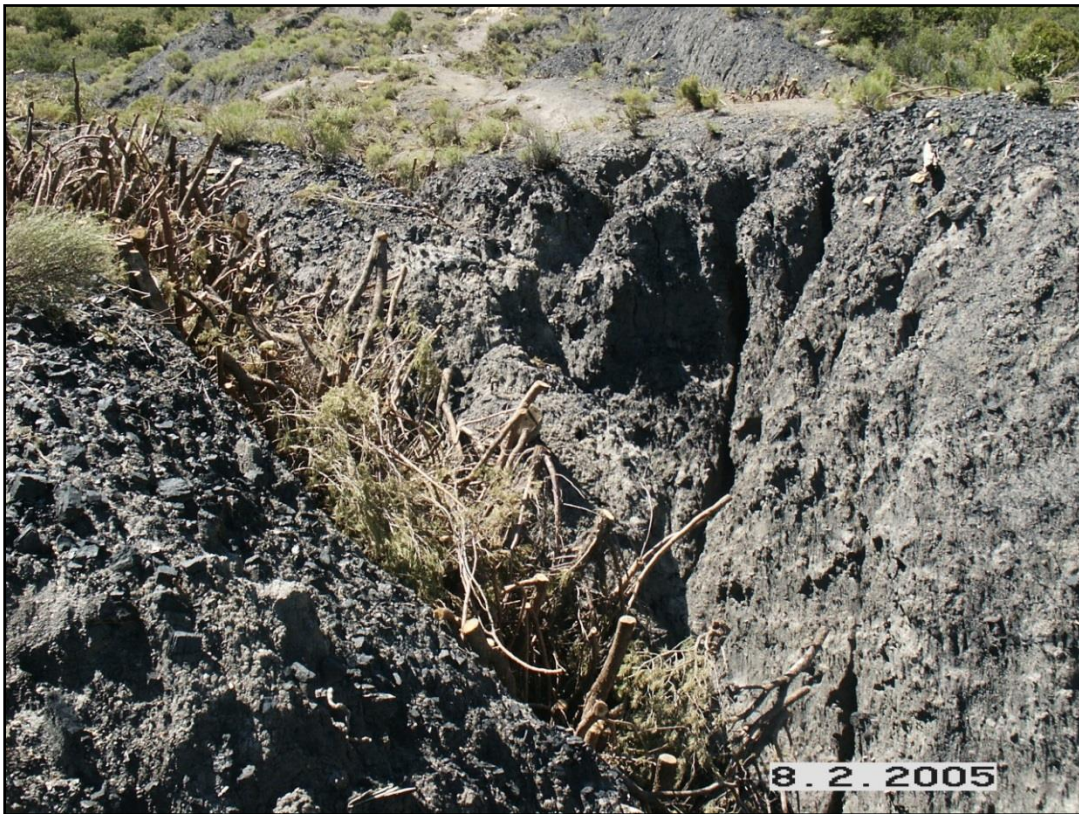
Newly installed branch packing in small, deeply incised gully, looking upstream, 2005