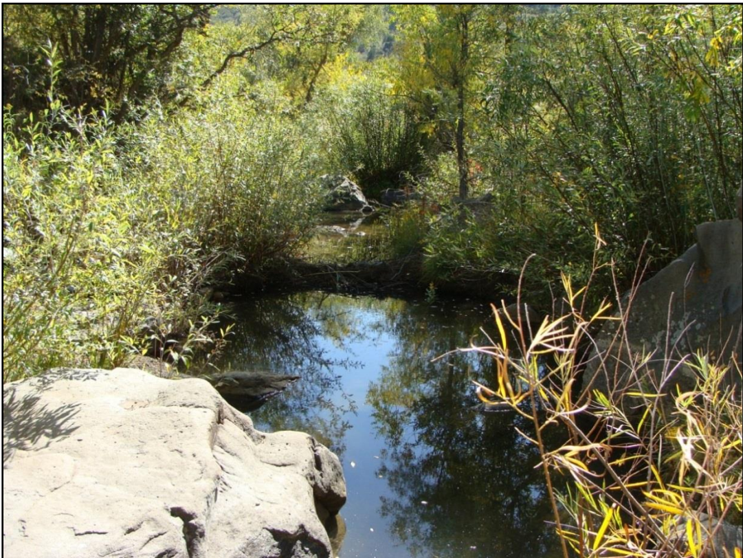
Beaver pond in Chicorica Creek below Gob Site A2N, 2010