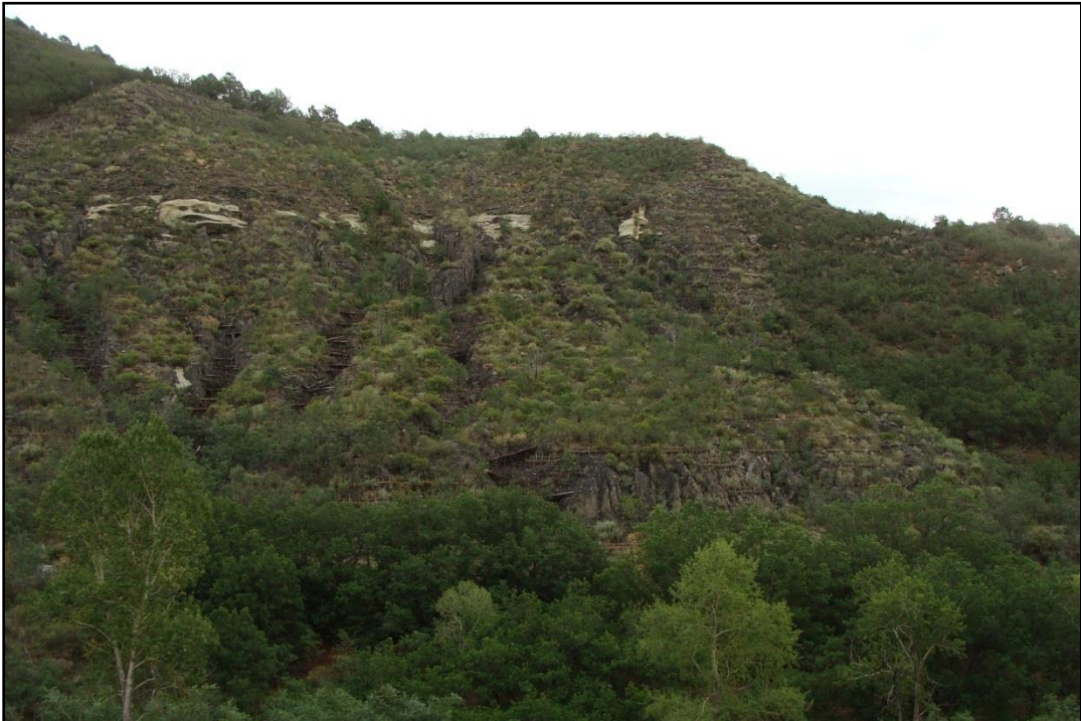
Gob Site A2N, 2011