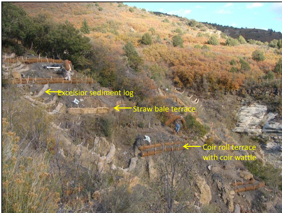
Aspen excelsior sediment logs in gully and straw bale and coir roll terraces on gob slope prior to seedling planting, 2010