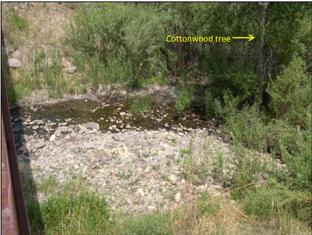
Same location in Chicorica Creek, 2006. Vegetation has since nearly completely covered the gravel bar.