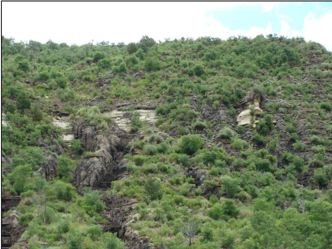
Close-up of Gob Site A2N, 2010