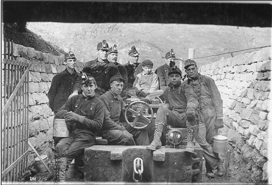
Sugarite coal miners, ca. 1918