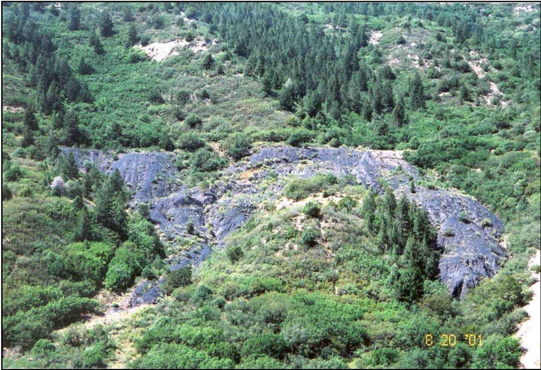
East-facing Gob Site A1, August 2001